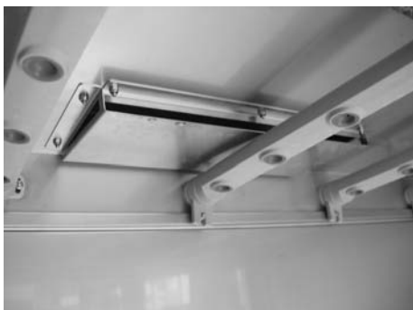
Suction channel of vapour extractor